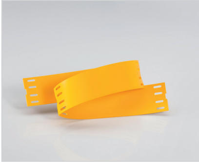
PPQ+19060 profile for printing in Partex MK10