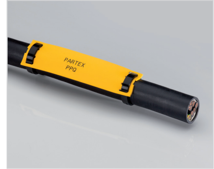
PPQ+19060 mounted on a cable.